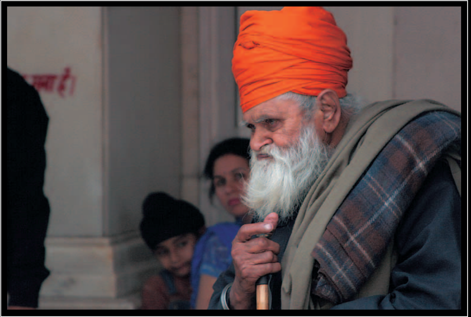
The passing of generations