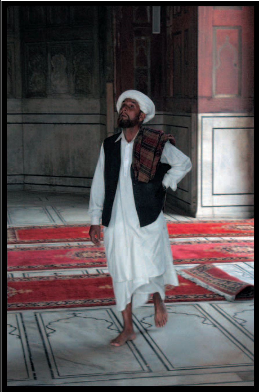
Time to reflect