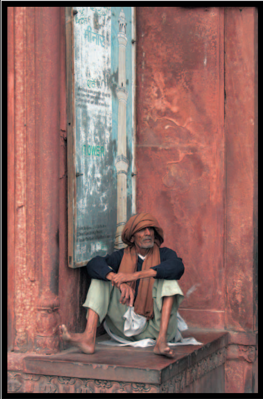
Cooling his heels