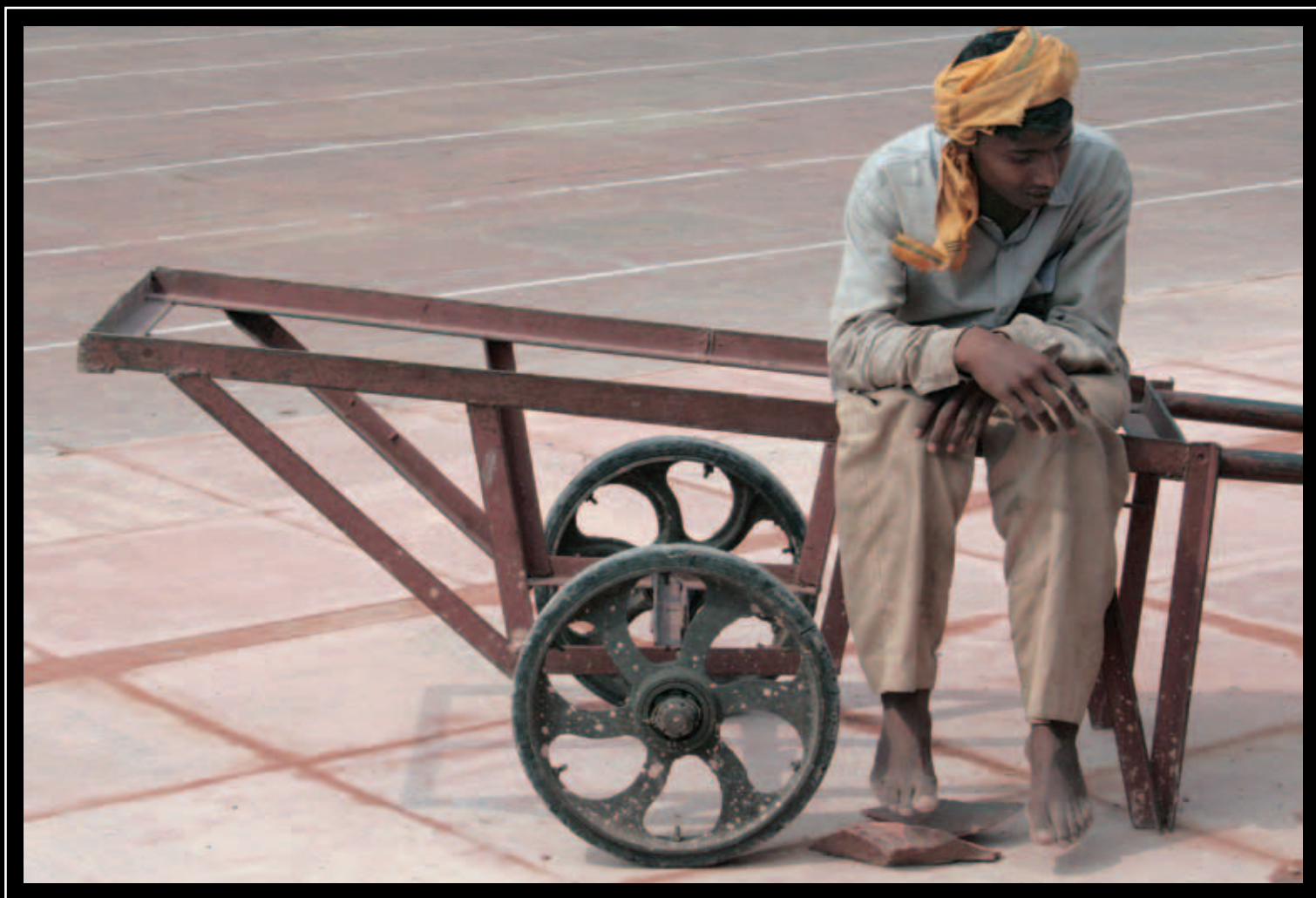
Brick layer on a much needed break